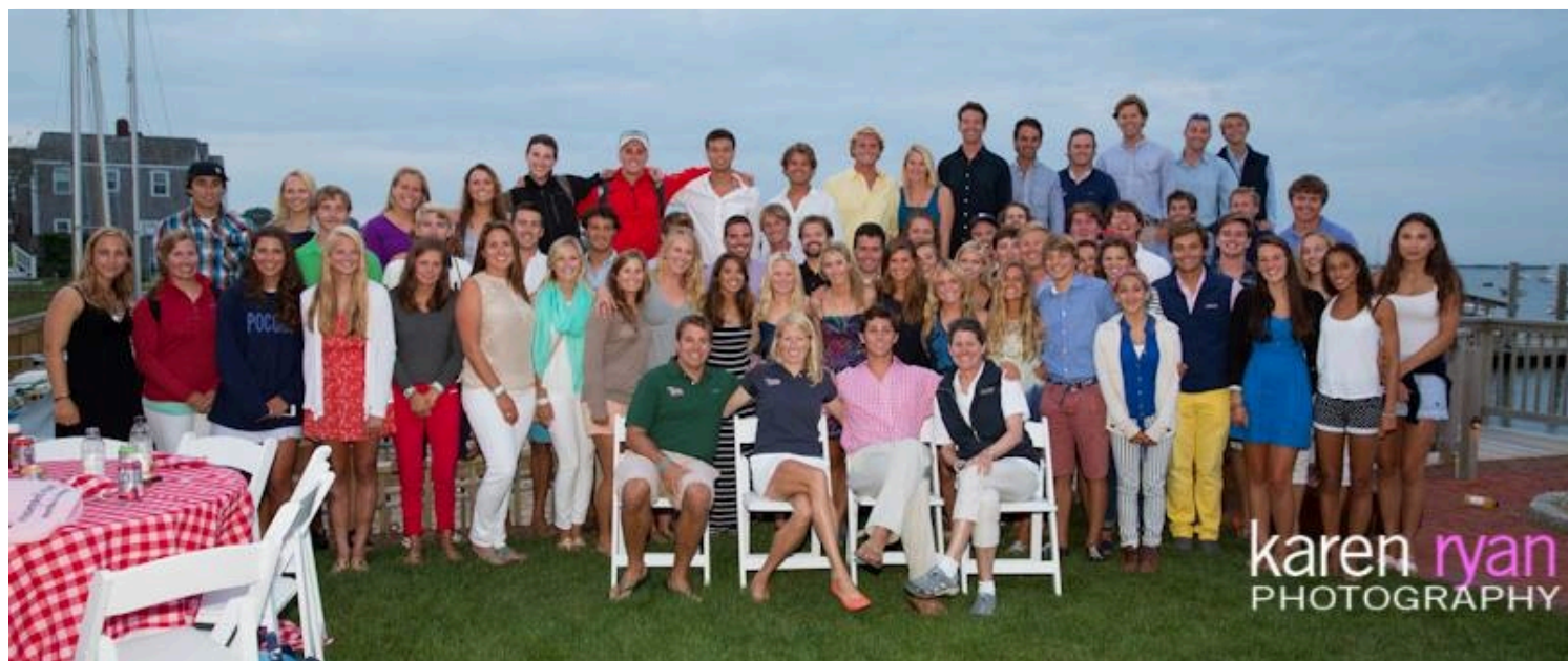
GHYC, NYC, and NCS Staff smile for the camera at the GHYC Nantucket Race Week BBQ!