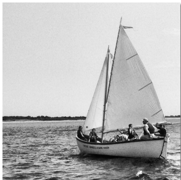
The Egan Maritime Surfboat Program sets sail.